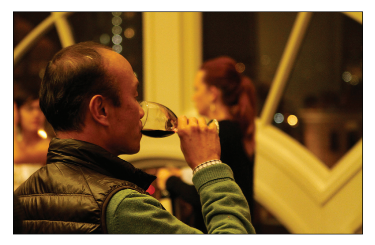
A guest enjoys the evening's wine selection.