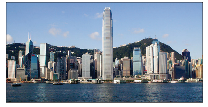
The Hong Kong skyline

The Asia Society's Pacific Cities Sustainability Initiative is expanding and moving forward! We are excited to announce a formal partnership with the Urban Land Institute (ULI), a major player in the field of real estate and land use policy with extensive experience in issues surrounding urbanization, conservation, and sustainable development. ULI brings a deep knowledge base and an extensive network of new contacts. We look forward to a fruitful collaboration.