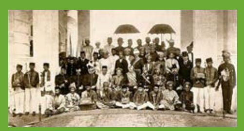
First Durbar (Conference of Rulers) held at Kuala Kangsar, Malaya, in 1897

Leong's work references a historical photograph of the First Durbar (Conference of Rulers) held in Malaya (now Malaysia) in 1897. The council was assembled under the British colonial regime and was comprised of Malay rulers and governors whose main responsibility was to elect the king. Compare Leong's work with the vintage photo. What similarities do you see? What differences? How does seeing this historical photograph change your reading of Leong's work?