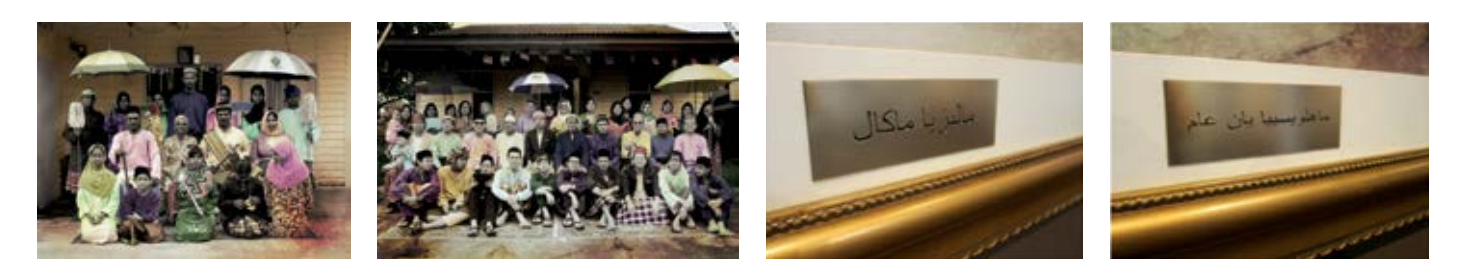
Keeping Up with the Abdullahs 2 and Keeping Up with the Abdullahs 1, 2012. Chromogenic print with plaque in artist's frame, 65 x 86 cm, edition 2/8. Solomon R. Guggenheim Museum, New York, Guggenheim UBS MAP Purchase Fund 2012.151. and 2012.151 © Vincent Leong. Photo: Courtesy the artist

These biting political commentaries present the artist's perspectives on contemporary Malaysia through a mixture of nostalgia and humor that also comments on Leong's understanding of himself and his culture. "I used to think that this was a really boring subject," he admits, "but you cannot escape it. At the end of the day, all your ideas come from your own personal identity."