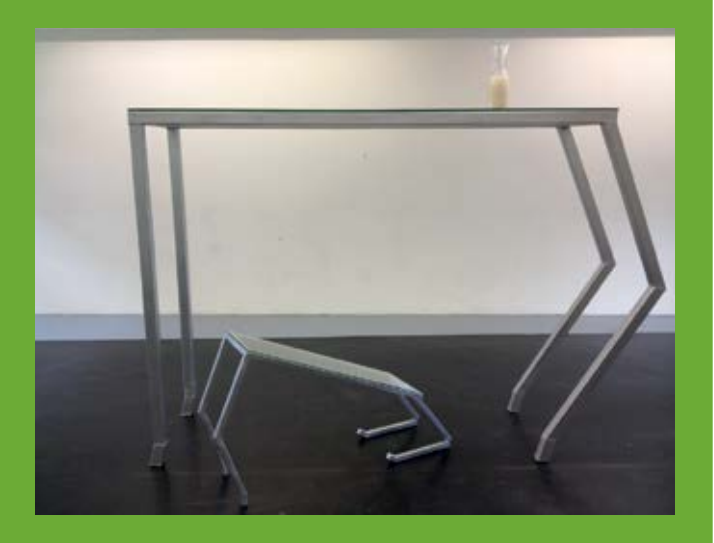
Our Children, 2012. Galvanized steel, glass, and milk, three parts: 157.5 \times 227.3 \times 59.7 cm, 66.7 \times 113 \times 30.5 cm, and 21.6 \times 7.9 \times 7.9 cm. Solomon R. Guggenheim Museum, New York, Guggenheim UBS MAP Purchase Fund, 2012, 2012.147. © Tang Da Wu. Installation view: No Country: Contemporary Art for South and Southeast Asia , Solomon R. Guggenheim Museum, New York, February 22–May 22, 2013.

Tang works in many mediums including painting, drawing, sculpture, installation, and performance. In Our Children , he refers to a story from Chinese opera in Teochew, the region in South China from which his family hails. The story focuses on the virtue of respect for one's parents ("filial piety") and the importance of cultural values, and the artist's sculpture represents an abstracted baby goat kneeling beneath its mother. The act of suckling is represented by a pitcher of milk