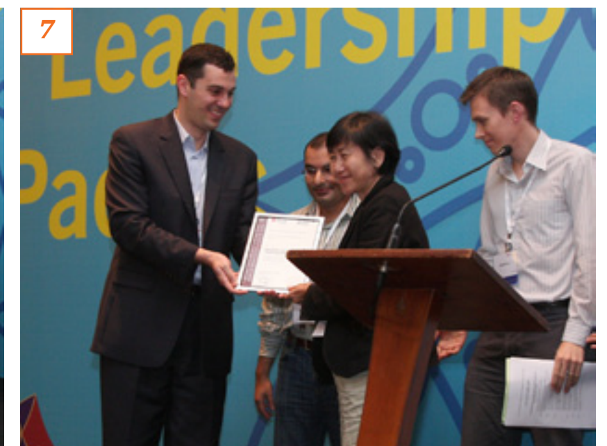
1. 2010 Asia 21 Young Leaders Summit Delegates