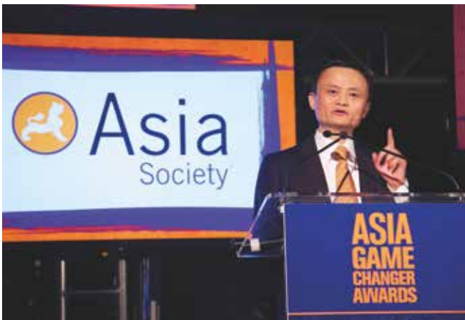
2014 Jack Ma, Executive Chairman, Alibaba Group, is recognized as Asia Game Changer of the Year for his history-making business and philanthropy in China. In his acceptance speech at the United Nations in New York, he talked about his company’s rise from humble beginnings, “I never thought I’d have a chance to be at the United Nations.”